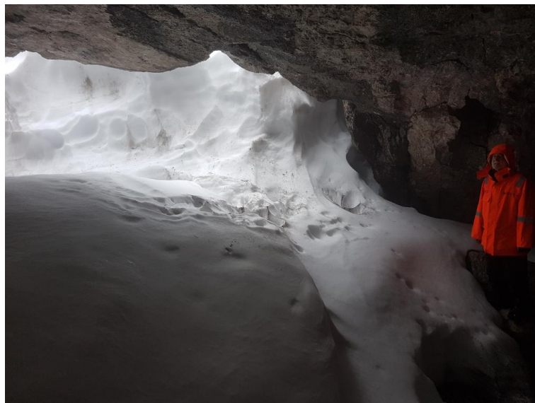
Figure 1: Philip Sargent by the snow filling Traungold Höhle where our top camp is located

The expedition was further way-laid by the discovery that our top camp was filled with snow.